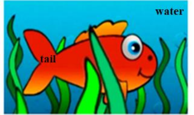
A red fish

Fish are animals. They live in ..... They have different colours. This fish is ..... in colour. Fish swim by moving it's .....The biggest ..... in the world is the whale shark.